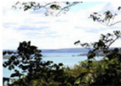
Overlooking Glen Lakes