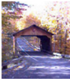
Stop #1, covered bridge